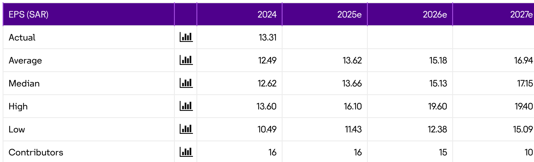
EPS (SAR, median)