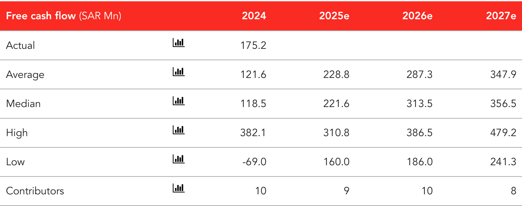
Free cash flow (SAR Mn, median)