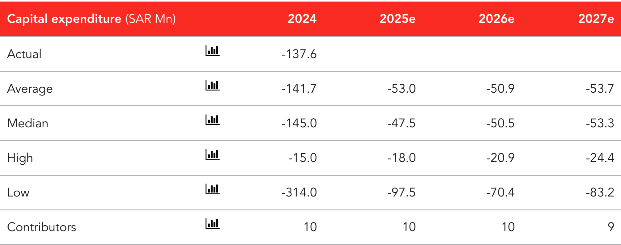
Capital expenditure (SAR Mn, median)