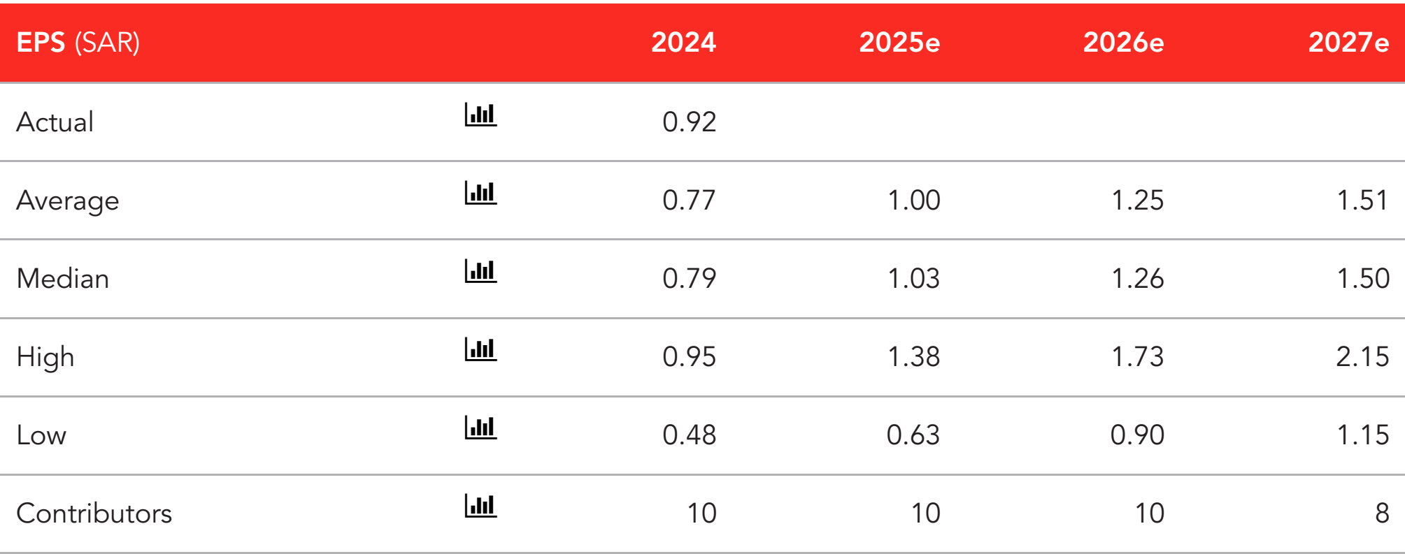
EPS (SAR, median)