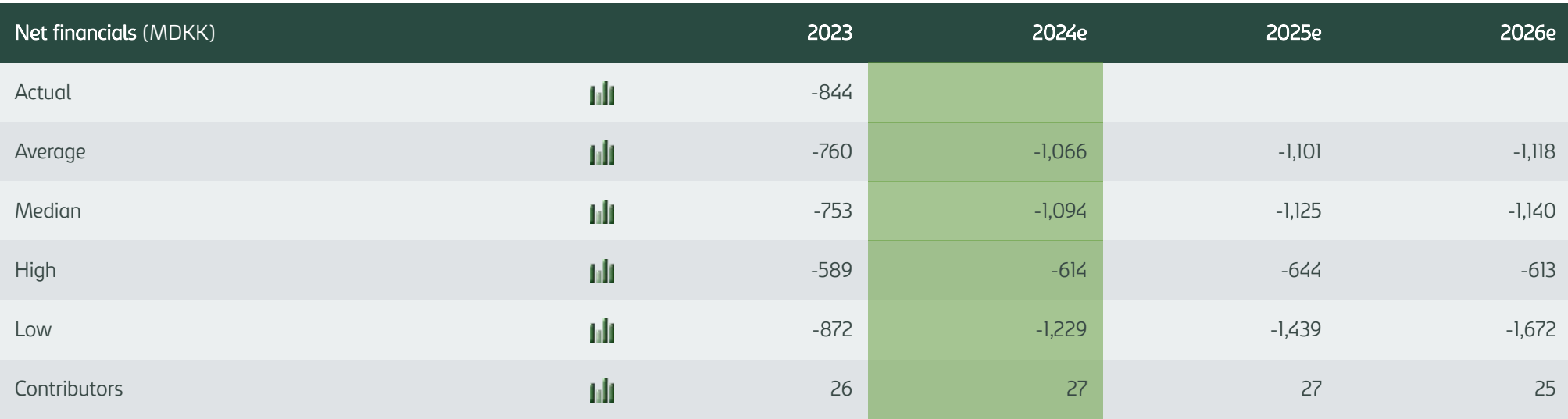
Net financials (MDKK, median)