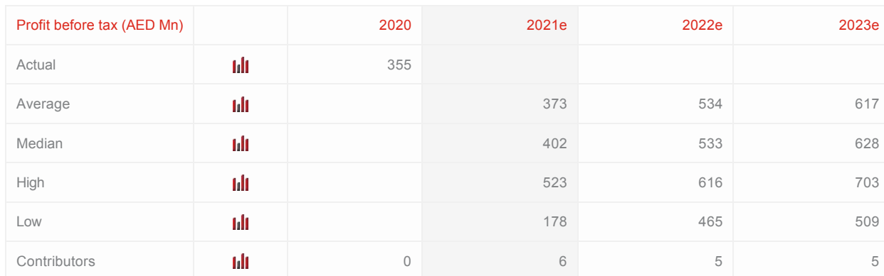
Profit before tax (AED Mn, median)