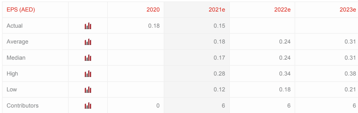
EPS (AED, median)