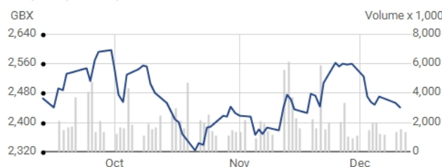
• Experian plc share price